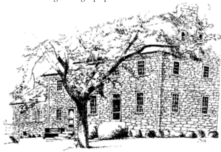
Stony Lonesome, the showplace of Mount Gilead

By 1826, four public roads led to Mount Gilead, including "The Great Road," the shortest route between Leesburg and Middleburg. Mount Gilead is described as a growing and prosperous village in the 1835 "Gazetteer of Virginia," and the site of the village is "a beautiful eminence, which rises to a moderate height, in a wide gap, or opening in the mountain." In 1835, the village contained "1 mercantile store, 1 handsome school house built expressly for the purpose, and the Methodist society hold their meeting for worship therein: an infirmary, which is an infant institution for the restoration of persons laboring under chronic diseases, and which has been attended with unusual success — 2 boot and